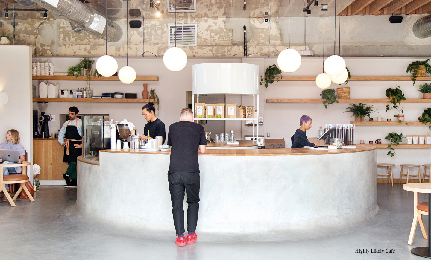
Highly Likely Cafe