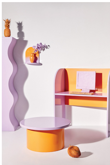
Objects for Objects